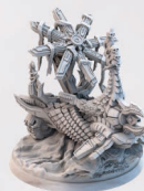
NAGLFAR BOSS MINIATURE