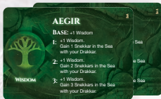
TWO-SIDED GOD CARD