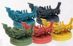
20 SNEKKAR MINIATURES (4 PER PLAYER)