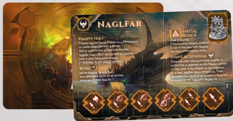
NAGLFAR BOSS TRAY