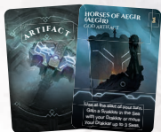
AEGIR ARTIFACT CARD

This expansion introduces a new God, Aegir, which allows players to strike from the Sea with powerful Snekkars, supporting Armies struggling in Battles. But it's not only players that will gain more control of the Seas. This expansion also introduces a new Boss. Naglfar, the ghost ship, will be haunting the Seas by blocking players' possibilities and harassing Armies that wander too close to the shore.