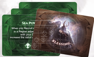
12 AEGIR BLESSING CARDS